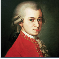
Wolfgang Amadeus Mozart (1756-1791)