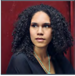
Records from a Vanishing City Jessie Montgomery (b.1981)